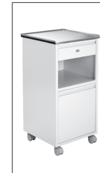
Ax1006 / Ax1006A