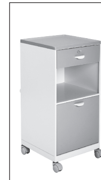
Ax1009 / Ax1009B