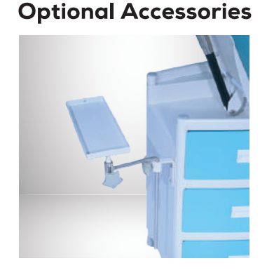
Adjustabe BP Apparatus Tray Height and multiple position adjustable BP apparatus tray