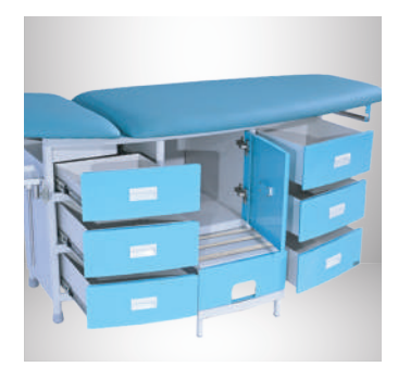
Adequate Storage Space Providing easy access to essential supplies