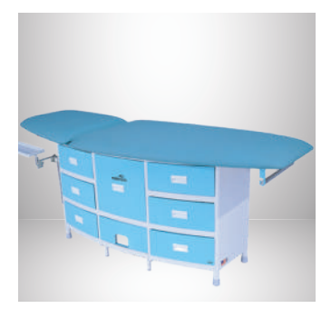
Thoughtful Design Oval design to differentiate your set up