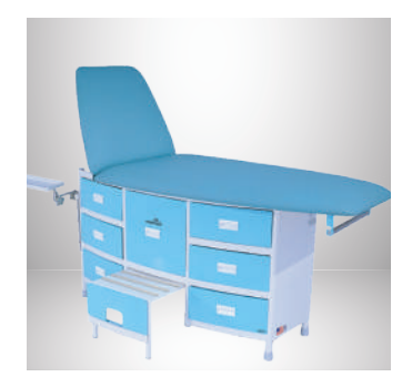
Patient Positioning For better access during examination