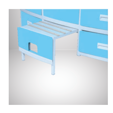
Sliding Step Stool Aluminum grip on the step stool for easy ingress/egress