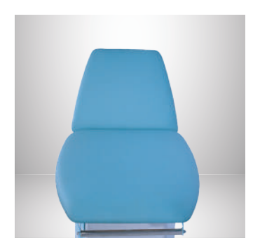
Unmatchable Comfort As soft and comfortable as it looks