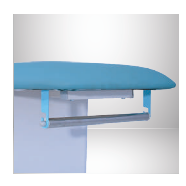
Paper Roll Holder To minimize surface contamination